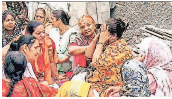
Relatives of the deceased mourn them on Thursday.