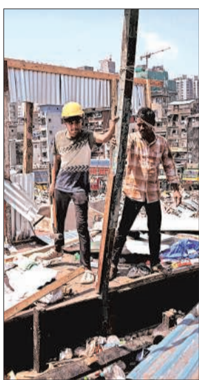
Following the demolition, railway staff dismantled softer structures at the site. NIDHI JACOB

A DAY after clashes broke out at Garib Nagar in Bandra East during Western Railway's anti-encroachment drive, after authorities demolished two mosques in the area along with other structures including houses that were termed as illegal, the Western Railway (WR) on Thursday continued with its drive clearing nearly 90 per cent of encroached railway land.