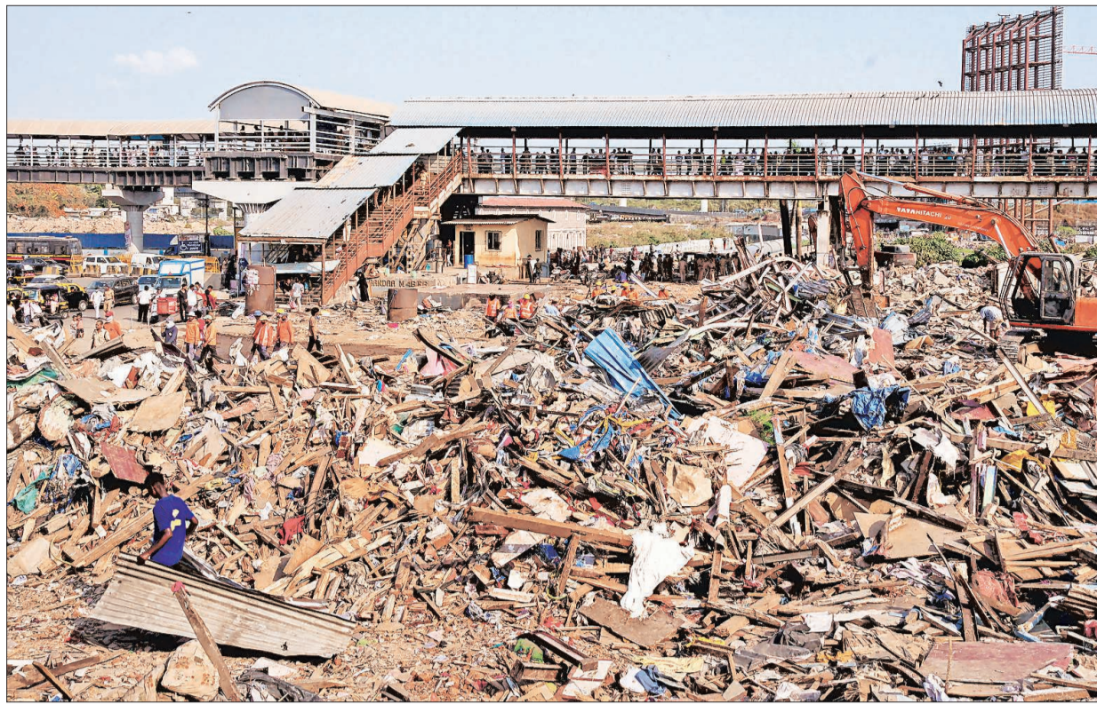
The five-day drive seeks to remove around 500 illegal structures spread across 5,200 sqm of encroached railway land near Bandra station.