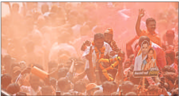
BJP workers celebrate in Panvel on Monday.

THE BJP emerged as the leading party in rural areas across Maharashtra in the zilla parishad and panchayat samiti elections, the results of which were declared on Monday, while the two factions of the NCP appear to have benefited from contesting together on a common symbol. The results also indicate Deputy CM Ek-nath Shinde's Shiv Sena has performed significantly better than the Uddhav Thackeray-led Sena faction, making in-roads in rural Maharashtra.