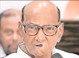
NCP-SP chief Sharad Pawar